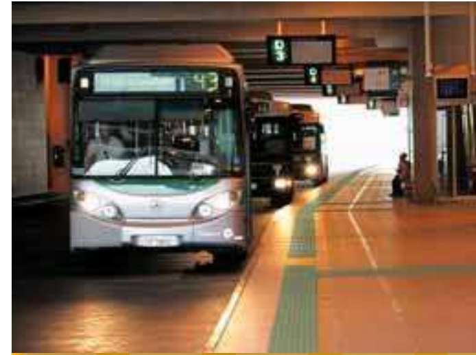
Perth Transit Authority